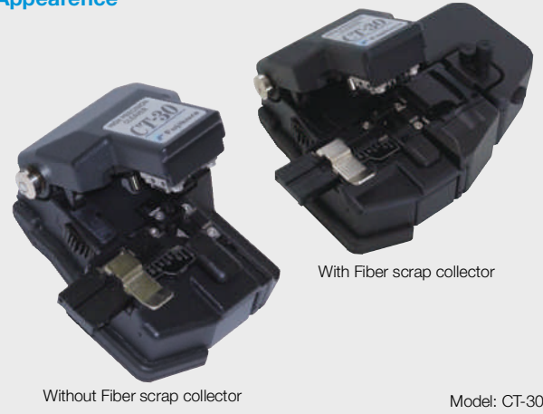
Without Fiber scrap collector